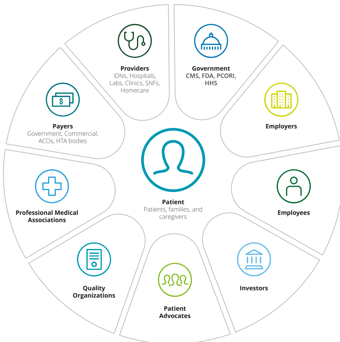
Figure 3. Key Diagnostic Stakeholder Groups

It is important to recognize that these five categories are relevant across the health care ecosystem and reflect the perspectives and priorities of many different stakeholders – payers, providers, new “at-risk” providers who must think like payers, government agencies, and of course, patients, caregivers, and patient groups. These stakeholders are highlighted in Figure 3.